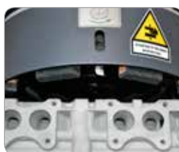
SEGMENTED GRINDING WHEEL AND TOOL