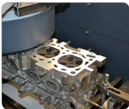
ALUMINIUM HEAD RESURFACING WITH TOOL