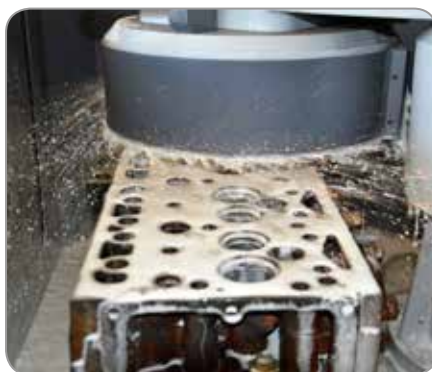
WET SURFACE GRINDING WITH COOLANT FLUID