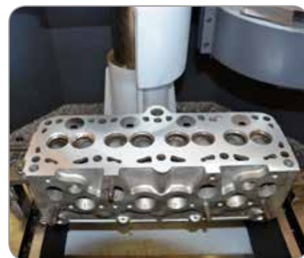
ALUMINIUM + STEEL PRE-CHAMBERS HEAD RESURFACING