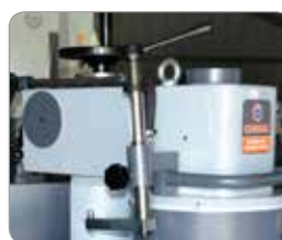
WHEEL DIAMOND DRESSER